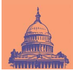
Capital Area Burglar and Fire Alarm Association

A Publication of the Texas Burglar & Fire Alarm Association