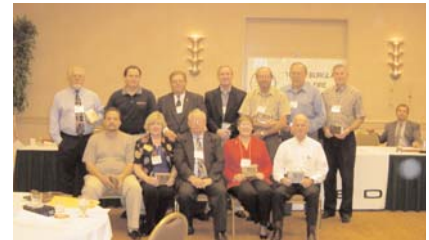
The 2001 Board