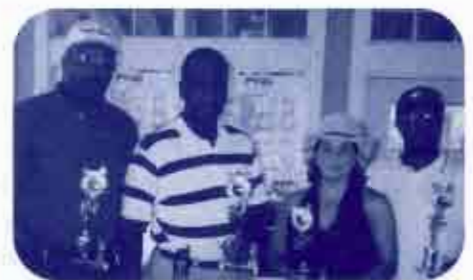
3rd place low gross BMA Systems, Inc. Team