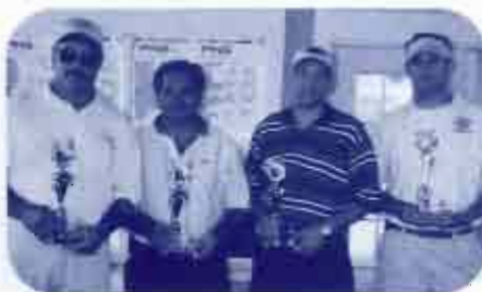
2nd place low net DSC Team