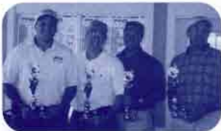
1st place low net Brink's Home Security, Inc. Team