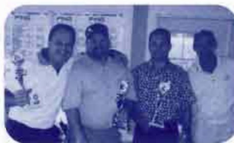
2nd place low gross Carter Cabling & Security Products