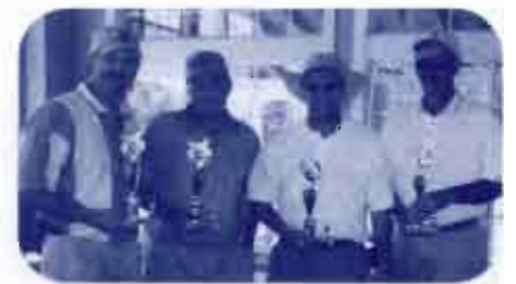
3rd place low net LiteCom / ADI