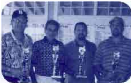
1st place low gross Tri-Ed Distribution, Inc. Team