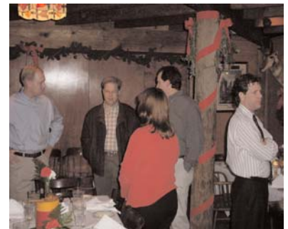
NTAA Holiday Party