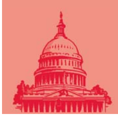
Capital Area Burglar and Fire Alarm Association

A Publication of the Texas Burglar & Fire Alarm Association