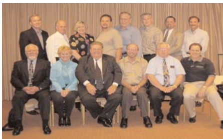
Your New Board

Our strong new team built on a combination of experienced leaders who have served before and new energetic leaders